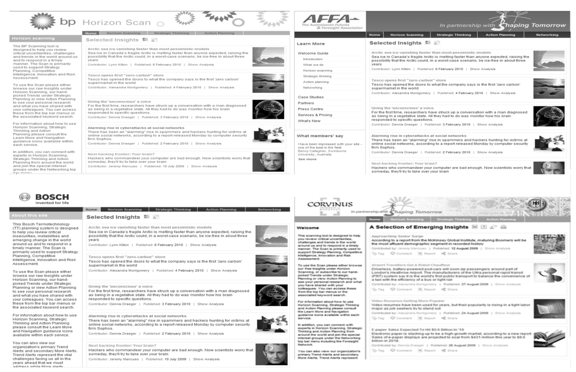
Figure 62: Strategic Foresight using common cloud computing platforms.

In the last month or two adventuring competitors and co-creators (commercial organizations, education establishments and not-for-profits) have begun aggregating their knowledge through futures portals hosted in 'cloud computing platforms' ( Figure 62 ). The benefits of this to participants are lower costs, use of proven operating processes and foresight methods plus better knowledge of emerging change through sharing ideas and discoveries.